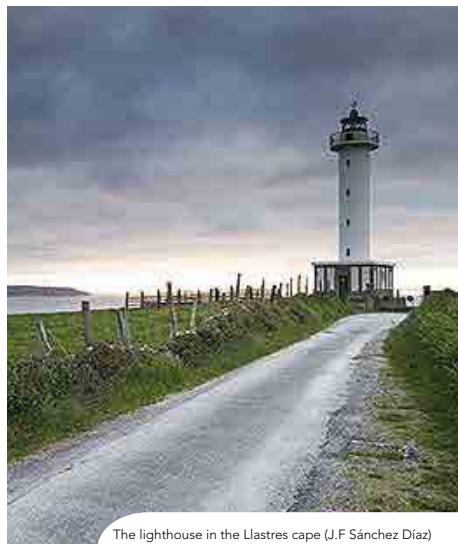
The lighthouse in the Llastres cape (J.F. Sánchez Díaz)