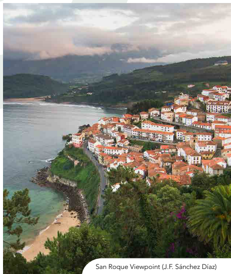
San Roque Viewpoint